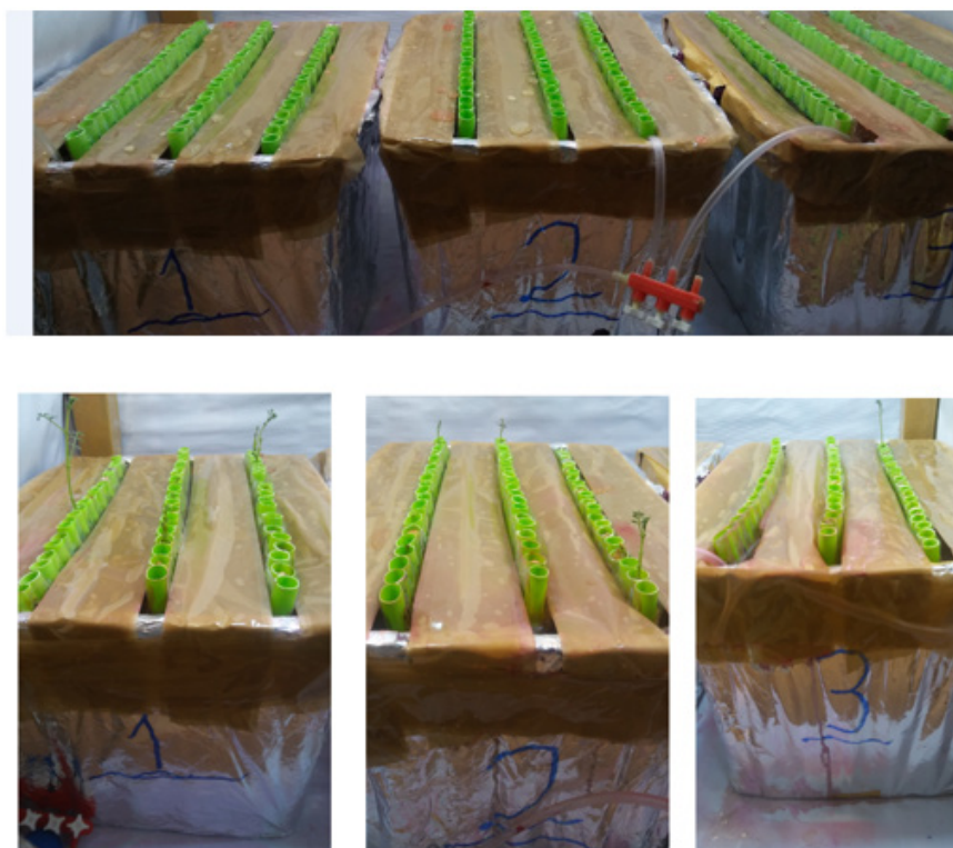
Figure 1: Schematic representation of the Hydroponic Rhizotron system.