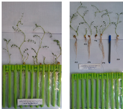
Figure 2: Root distribution of ten Chickpea genotypes at 6 weeks under the hydroponic system.

long lateral roots, deeper roots with sparse and short branches, and fine roots (Figure 2). Shoot-related traits, i.e. shoot height, leaf branch numbers and shoot dry mass, were measured at harvest (42 days after sowing). ANOVA identified significant differences among genotypes in shoot height and shoot dry mass.