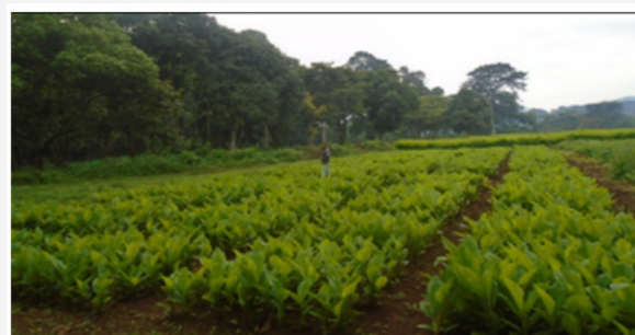
Figure 2: View of the experimental plots at tillering stage.

The treatments consisted of five levels of nitrogen (0,46,69,92 and 115\text{Kg ha}^{-1} ) and five equal split applications of nitrogen. The time of nitrogen application were adjusted according to [8] growth stage for turmeric plant. Accordingly, the timings of N application were adjusted as follows: first time of application (full dose at emergence); second time of application (half at emergence, half at lag growth stage); third time of application ( 1/3^{\text{rd}} at emergence, 1/3^{\text{rd}} at lag growth stage and 1/3^{\text{rd}} at tillering stage); fourth time of application ( 1/4^{\text{th}} at emergence, 1/4^{\text{th}} at lag growth stage, 1/4^{\text{th}} at tillering stage and 1/4^{\text{th}} at slow growth stage) and fifth time of application ( 1/5^{\text{th}} at emergence, 1/5^{\text{th}} at lag growth stage, 1/5^{\text{th}} at tillering stage, 1/5^{\text{th}} at slow growth stage and 1/5^{\text{th}} at crop approaching maturity stage). At crop emergence, urea was drilled between rows and incorporated into the soil immediately based on the treatments. The second, third, fourth and fifth equal split N urea applications were done by side dressing at the specified growth stages of the crop: at the beginning of July, August and September, and at the end of October 2016, respectively.