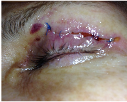
Figure 3: Wound dehiscence.