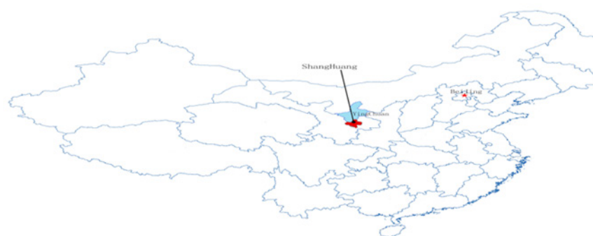
Figure 1: The Location of Shanghuang eco-experiment station in China.

With the increase of population and economic development of a country or a region, people consume more and more plant-based food, there is an increasing demand for the quantity and variety of plant-based food production, but original forest ecosystem products and services cannot meet the need of demand for the quantity and variety of plant-based food production, most of the original forest has become food plants, farmland, man-made forest and grass (Guo 2121, Guo and Shao,[7]). A lot of exotic food plant was introduced to produce food and meet the need of the people. Because exotic food plant changes the plant resources relationship and the climate change with year and month in a year, which will cause vegetation decline or resources waste, and is not good for sustainable use of nature resources and high-quality produce of food plant. The high-quality development of agriculture is to take some measures and methods to make the land produce the maximum output and services to meet people's yearning for a better life and the needs of agricultural production services (Guo [8]). In order to solve these problems, the plant resources relationship has to be regulated to carrying out sustainable use of nature resources and agriculture high quality development.