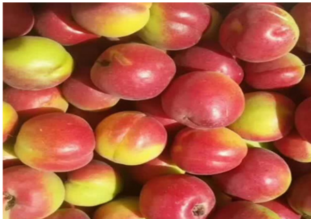
Figure 5 The shape of red plum Apricot in the Shanghuang Eco-experimental Station.

blossom and bear fruit, see Figure 4. This kind of plant resource relationship cannot be regulated. Another is not balance or harmony plant resource relationship such as most of exotic plants, see Figure 5 and Figure 6. These kinds of plant resources relationship has to be regulated.