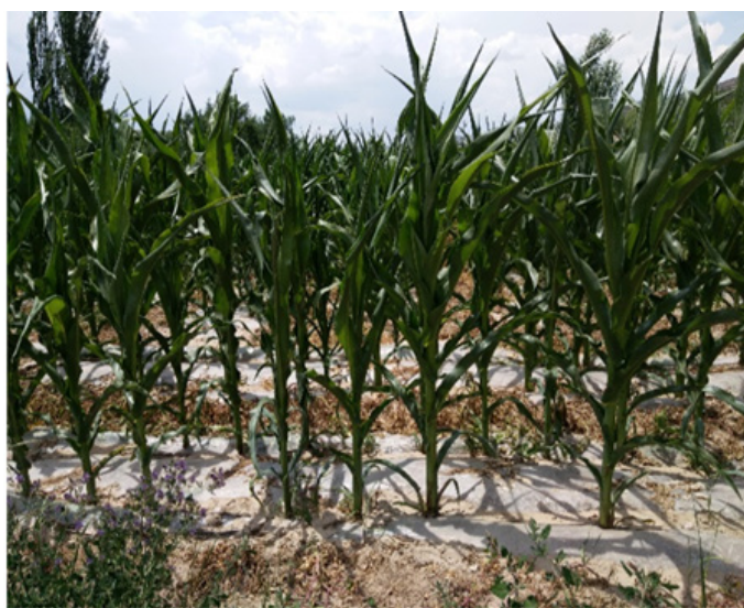
Figure 6: Mulch and ridge tillage corn plants wilt in critical period of plant water relationship regulation in the Shanghuang Eco-experimental Station in 2021.

The critical period of plant water relationship regulation is the most important period in plant growing season because it decides the maximum yield and benefit food plant, which range from the starting time soil water resources in the maximum infiltration depth equal soil water resources use limit by plant (Guo and Li 2009) to the failure time to regulate plant water relationship on soil water vegetation carrying capacity. The soil water resources in the critical period of plant water relation regulation are the soil water resources in the root zone at the starting time of the critical period of plant water relation regulation plus soil water supply from