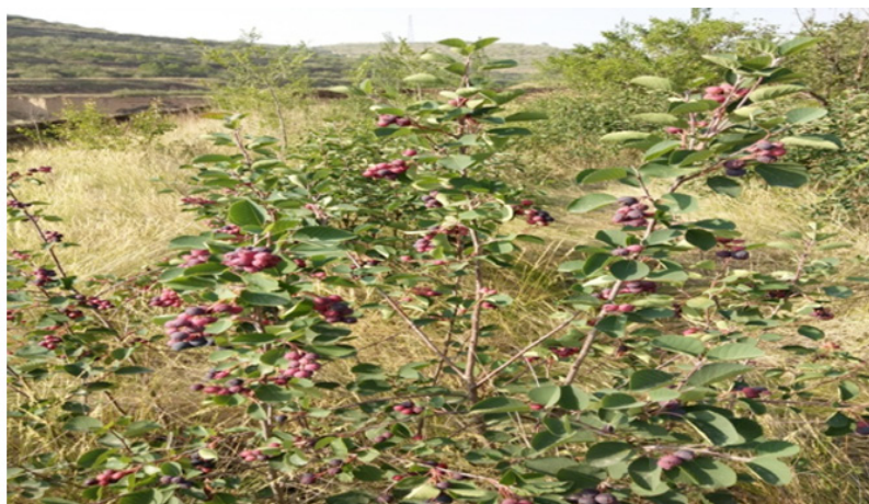
Figure 4: Saskatoon Berries Grow Well in the Shanghuang Eco-experimental Station.