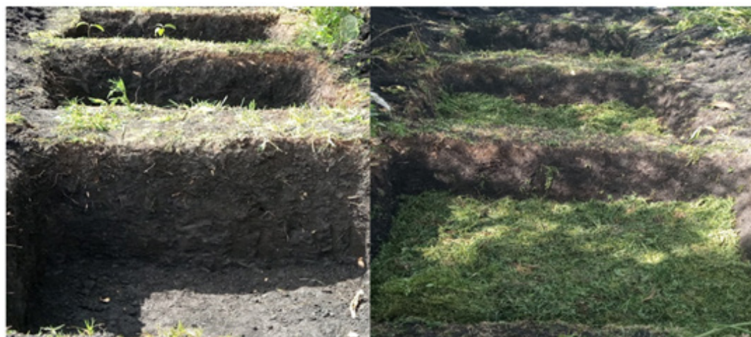
Figure 2: Pit Prepared for Compost and While parthenium is Added.

At the Farmers' home garden, a 1 m x 1 m x 1 m Pit of parthenium compost was established. The composting unit is made of durable materials for ongoing operation. Before flowering, the Parthenium biomass was collected and cut into 1-2 inch-sized pieces. mechanically and for about 60 days with agricultural and animal wastes (Figure 2).