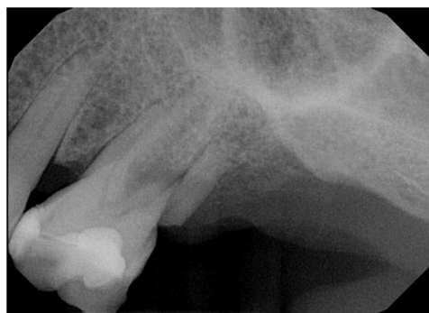
Figure 5: Showing radiograph of the site before the extraction.