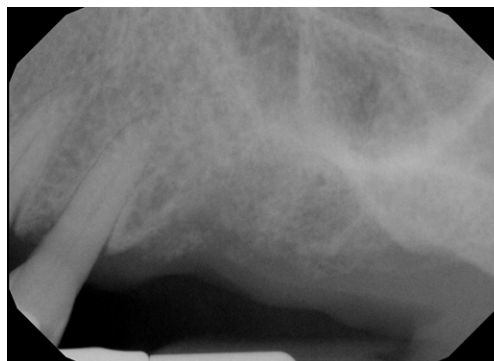
Figure 6: Showing radiograph of the site six weeks after the extraction and bone grafting.