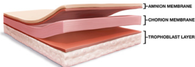
Figure 1: Showing a diagram illustrating the three layers of Amnion, chorion and trophoblast.

•• Salvin Dental Specialties, 3450 Latrobe Dr, Charlotte, NC 28211