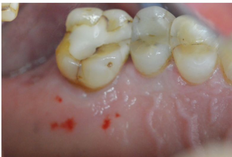
Figure 2: Showing before the extraction.

keratinized gingival tissue (Figures 3). All cases showed no visible loss of the bone graft material during the or the membrane during the healing, no other complications were reported. A periapical film taken at the sixth week visit and compared to the pre-operative film revealed good bone fill and readiness of the site to receive dental implant ( Figures 4-6).