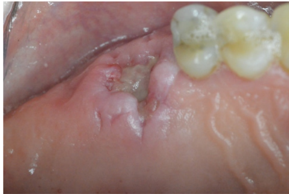
Figure 3: Showing two weeks healing with initiated soft tissue formation replacing the membrane.