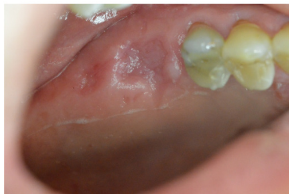
Figure 4: Showing complete maturation of the soft tissue covering into keratinized tissue after six weeks.