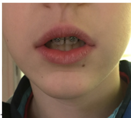
Figure 3: The dented subject swallowing icon: "my lips are relaxed, my molars in occlusion".

The dented subject swallowing icon: "my lips are relaxed, my molars in occlusion" is activated by the trigeminal nerve that will allow not only the molar occlusion but also the protection of the tongue against the bites thanks to the richness of the trigeminal nerve endings of its epithelial cover [6].