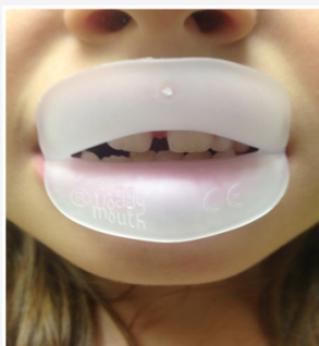
Figure 1: froggymouth prevent a bilabial contact and the sucking deglutition

control of this dynamic will be supported by the trigeminal nerve and will inhibit the action of the facial nerve that controls the labial dynamics. We will thus obtain an almost immediate acquisition of the new praxis (Figure 1-3).