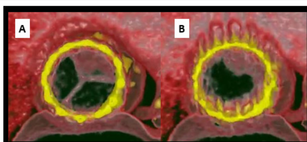
Figure 1A: Short axis view with 4DCT of the Aortic Valve Replacement showing clot in one leaflet during diastole.

Valvular heart disease affects >100 million patients worldwide out of which 200,000 cases of aortic valve replacements are performed annually and the numbers are predicted to rise further due to the aging population and a subsequent increase in degenerative valve disease. Based on an analysis of the Society of Thoracic Surgeons National Database; between 1997 and 2006, Bioprosthetic tissue valve replacement gained prominence causing a massive shift from mechanical to bioprosthetic valve replacements. The use of mechanical valves decreased to 20.5%, whereas the use of bioprosthetic valves increased to 78.4% [1, 2]. The transition from mechanical to bioprosthetic valve was partially attributed to the fact that, younger individuals refuse long-term anticoagulation and elderly patients are at a higher bleeding risk [1].