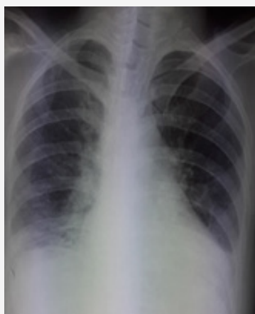
Figure 1: The chest X-ray showing interstitial syndrome.

Transthoracic echocardiography (TTE) showed severe enlargement of all 4 cardiac chambers, left ventricular end-diastolic diameter (LVEDD) of 60 cm, left ventricular ejection fraction (LVEF) of 30%–35%, marked right ventricular (RV) dysfunction, pulmonary hypertension (estimated at 70mmHg) and moderate tricuspid regurgitation, without evidence of pericardial effusion. Laboratory studies showed elevations of serum creatine phosphokinase (CK): 1070 UI/l (Normal<179 UI/l) and lactate dehydrogenase (LDH): 435 UI/l (N = 76–156) and raised CRP: 60mg/l and sedimentation rate: 80 mm/h. Anti-PL12 antibodies was positive. Antinuclear antibody and anti-DNA were negative and other biochemical parameters were normal.