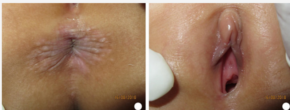
Figure 5,6 : After the first stage of wart.