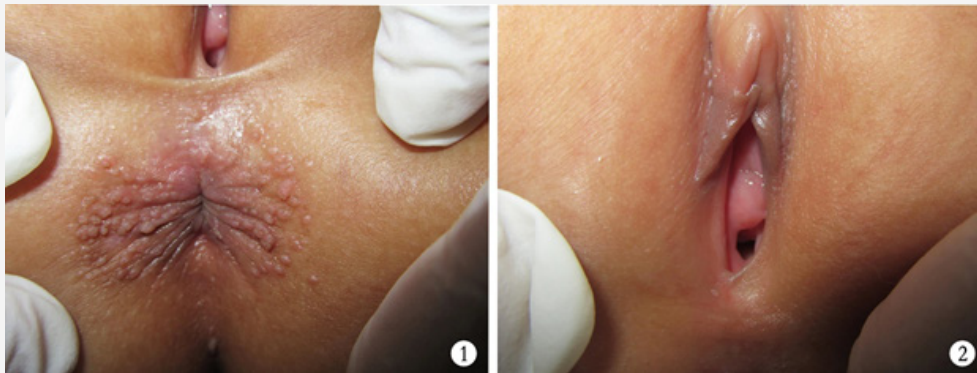
Figure 1,2 : Skin lesions at the first consultation.

quality and partial fusion. A few vegetations were seen around the vaginal opening (Figures 1&2). Laboratory examination revealed the acetic acid white test was positive. Human papillomavirus test showed that HPV51 was positive and HPV11, HPV16, HPV18, etc. were all negative. No abnormality was found in blood, urine, stool, HIV, TPPA and RPR examination. The histopathology of the skin lesions showed hyperkeratosis of epidermis with parakeratosis, acanthosis, papillomatosis and vacuolated cells in the upper part of stratum spinosum (Figures 3&4). The histopathological diagnosis was condyloma acuminata.