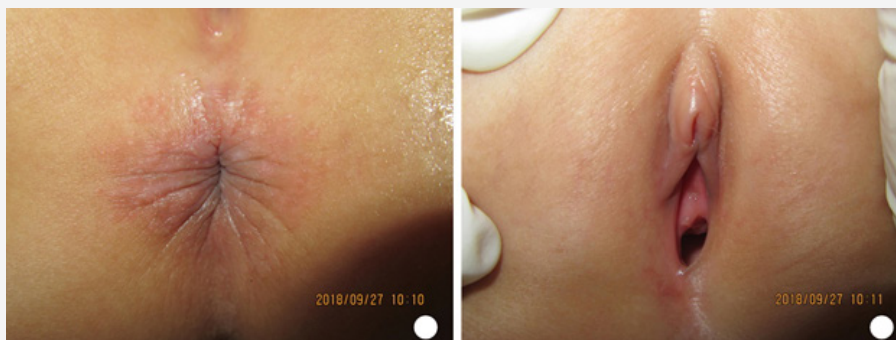
Figure 7,8 : Phase III prevention of recurrence.

time and stopping the drug after 3 consecutive days for 4 days was a course of treatment. In the second stage, after the warts body fell off and the wound healed (Figures 5&6), another 2~3 courses of treatment were repeated to further remove the subclinical virus. In the third stage, wet application with 4-6 layers of gauze soaked in 1:50 diluent of petaline (1ml of stock solution plus 50ml of distilled water) on the original damage parts to prevent recurrence (Figures 7&8), each time for about 10min. Once a day in the first month and once every two days in the second and third months. No new warts were found during follow-up for 1 year (Figure 9), and the re-examination was negative for HPV51.