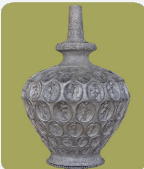
Figure 1: The Baratti Amphora (all the images of the amphora are extracted from the 3D model realized by the ALS Lab of CNR, Pisa).

The Baratti Amphora is a silver vase of about 60 cm of height, and 35 cm of diameter (Figure 1) it could have contained about 22 liters of liquid. The amphora (remains of the welding of the two handles are still visible in the upper part, (Figure 2) is composed of very pure silver, weighting about 7 kg. The amphora was casually recovered from the bottom of the sea in 1968 by a fisherman. The long permanence in sea water and the mechanical damages suffered during the recovery suggested the need for a long and careful restoration, which was performed at the laboratories of the Florence Archeological Superintendence and lasted several years.