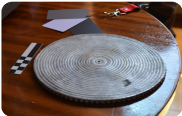
Figure 8: Bottom part of the amphora (Photo Stefano Pagnotta, all rights reserved).

From the analysis of the XRF spectra, we can confirm the results of the AAS analysis for what concerns the quality of the silver used, which is very pure (Figure 5). Traces of Fe, Cu and Pb are present, for a total contribution of about 2% (estimated using the PyMCA software, based on the Fundamental Parameters method described by Solé et al. [5]). Quite surprisingly, we detected in all the spectra analysed a weak, but well defined, fluorescence signal from gold, which is present in the silver of the amphora at a percentage around 2%. It's not clear why this signal was not observed in the 1986 analysis, but it's probable that the AAS instrument used at the time was not able to detect gold at the concentrations observed fifty years after, using the XRF technique. The analysis of the bottom of the amphora (Figure 8) confirmed the presence of gold around 2% and evidenced the higher concentration of lead with respect to the body of the amphora, but also Cu and Fe were present at higher concentrations (5% total), which implies a lower Ag concentration in the base of the amphora with respect to the body (Figure 8 & 9).