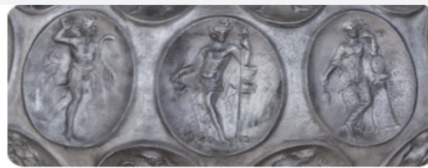
Figure 3: Satyr, Dionysus and Ariadne.

might suggest that the liquid contained in the vase should have been wine (Figure 3).