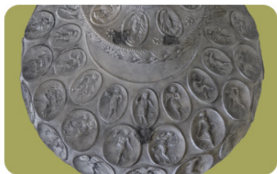
Figure 2: Traces of the points of welding of the amphora handles (now lost).

One of the most puzzling mysteries of the Baratti amphora is the technique used for its realization. The surface of the amphora is decorated, in fact, with 132 oval medallions, organized in 10 registers (2 in the upper part of the neck, 1 in the bottom part of the neck and 7 in the body of the amphora). It's still unclear how these medallions were realized. The amphora shows no signs of welding, except for the connection between the body of the vase and its bottom; it was, therefore, realized in a single piece. The hypothesis formulated by the archaeologists at the time of the restoring was that the decorations were realized by forging, using a negative from the inside, at first, and then modified with a chisel to add the minute details of the figures that can be observed today. In support of their hypothesis is the fact that the bottom part of the vase was realized separately, and then welded to the rest of the amphora. The possibility of lost wax casting was explicitly dismissed. The main difficulty that this theory must face is related to the thickness of the amphora walls (comprised between 1 and 2 mm) which would make almost impossible the use of negative stamps; moreover, some parts of the amphora are hardly reachable from the inside (bottom of the neck) (Figure 2).