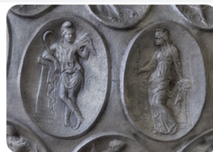
Figure 4: Attis and Cybele.

However, it's unclear whether the Baratti amphora was intended for an actual use at the banquet or would have been used only for decorative or ritual purposes. It's similarly unclear at what stage of its life the amphora was lost in the sea of Baratti, from where it was coming and where it was destined. The long permanence under the sea excludes the possibility of analyzing the possible content of the amphora, as was done in Legnaioli et al. (2013) for the study of an ancient oinochoe [3]. From the iconographic point of view, the number and disposition of the medallions themselves reveal an exoteric symbolism based on the Zodiac signs (12 medallions in the first two upper registers of the amphora neck) and seasons and regions of the world (8 medallions in the lower register of the neck). The Dionysian procession is depicted in the second and fifth register of the main body of the amphora (16 + 16 medallions), while the first and sixth register (16+16 medallions) depicts musicians and dancers. The middle registers represent 32 divinities and mythological figures (16+16 medallions) mostly related to oriental mystery cults as, for example, Dionysus, Attis and Cybele (Figure 4), the Dioscuri, Aphrodite, Paris and Helen of Troy. The last registers (16 medallions) at the bottom of the vase is devoted to the myth of Eros and Psyche (Figure 4).