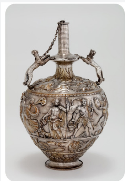
Figure 5: The Seuso amphora (© Hungarian National Museum, Budapest, Hungary).

Another viable hypothesis is the provenience of the amphora from the Danubian area. This theory arises from the comparison with a cylindrical silver container decorated with medallions coming from Viminacium, in the Roman region of Moesia (today's Kostolac, Serbia) [4]. Unfortunately, the container was stolen during the First World War and further comparisons are not possible anymore (Figure 5).