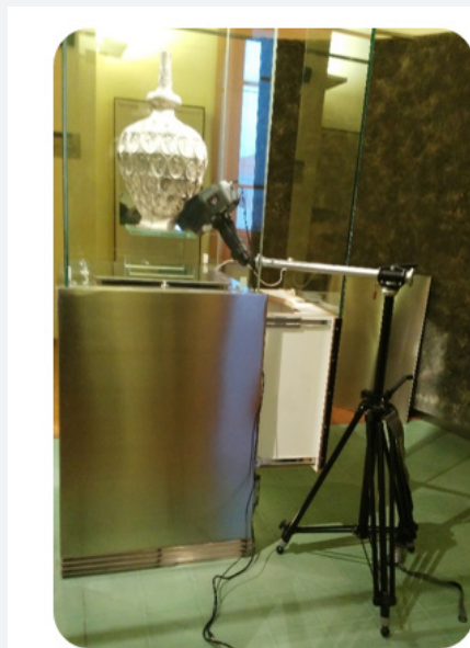
Figure 6: The XRF ELIO Instrument during the analysis of the Baratti amphora. The amphora was not removed from its display at the Museum of Piombino for this analysis.

performed in the Seventies of last century by the archaeologists in charge of the amphora restoration. During the cleaning process a few silver samples were taken from the amphora and analysed qualitatively using a mass spectrometer and quantitatively through Atomic Absorption Spectroscopy (Perkin-Elmer 403 AAS). The analysis revealed that the silver used for the realization of the Baratti amphora was very pure (96-98%) except in the zones near the welding of the handles and of the bottom part, who appeared contaminated by tin and lead.