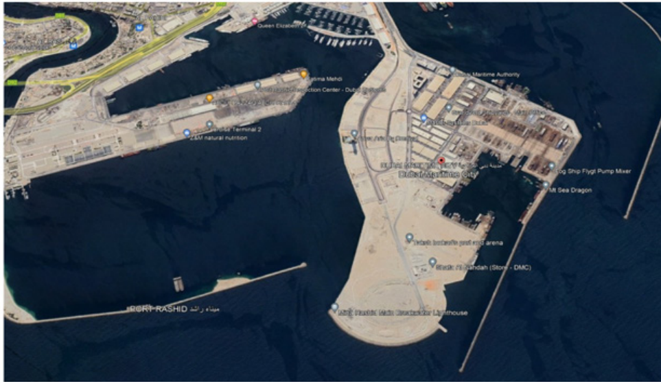
Figure 1: The Maritime Hub in Dubai Maritime City.

The Bluefield® concept was put forward over a decade ago as a “plug and produce” option for flexible maritime developments (Figure 2) [4], and subsequent research at the University of Gloucestershire led to further refinement of the conceptual underpinning and application potential of such construction projects [5]. This research centred on the development of Transformable