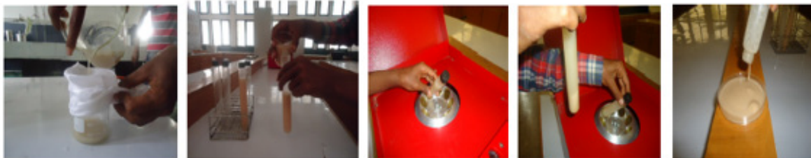
Figure 2: Centrifugal Starch separation process.