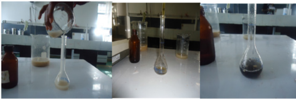
Figure 4: Iodine test for conformity of presence of starch in Butula lenta bark powder.