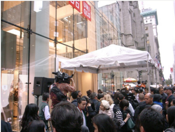
Figure 3: Fifth Avenue Store Grand Opening.

(equivalent to approximately 4959 m 2 ) sized megastore which outdoes all of the other daily fashion retailers, not only does the sheer magnitude of the store draw attention while the rich VMD and monitors help to build awareness of the UNIQLO brand inside of the store, but such mechanisms also facilitate deep penetration. Regarding promotion, publicity was achieved through efforts such as filling public transportation advertising space throughout Manhattan with UNIQLO advertisements and inviting New York mayor Michael Bloomberg to the grand opening ceremony. As can be seen in Figure 3, many media outlets came to cover the grand opening, and the UNIQLO opening was widely reported, including in Japan.