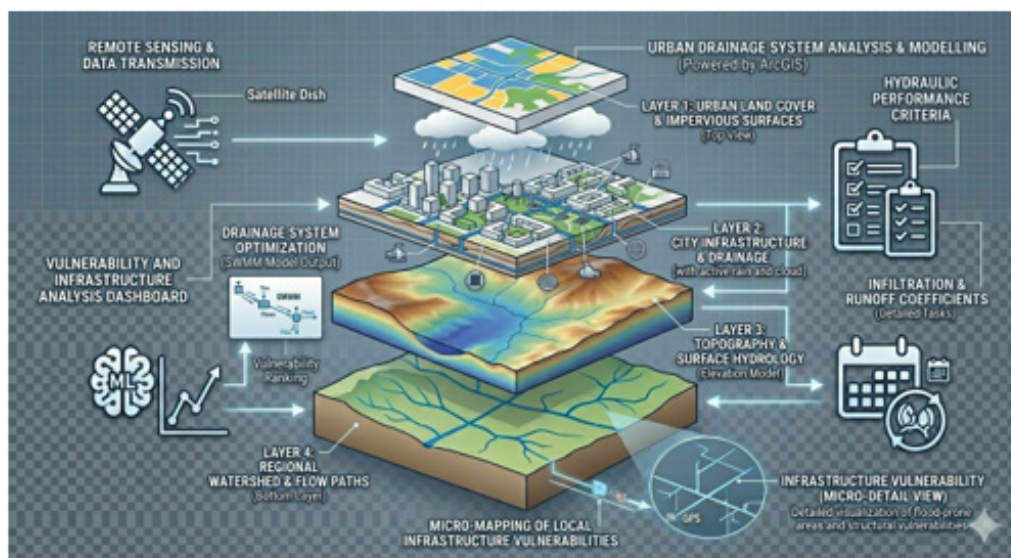
Figure 1: Integrated Framework for Urban Drainage Analysis and Infrastructure Vulnerability Mapping.

When integrated with hydrological models such as SWMM, GIS and remote sensing significantly enhance simulation accuracy and scenario-based planning capabilities (Figure 1). This integration