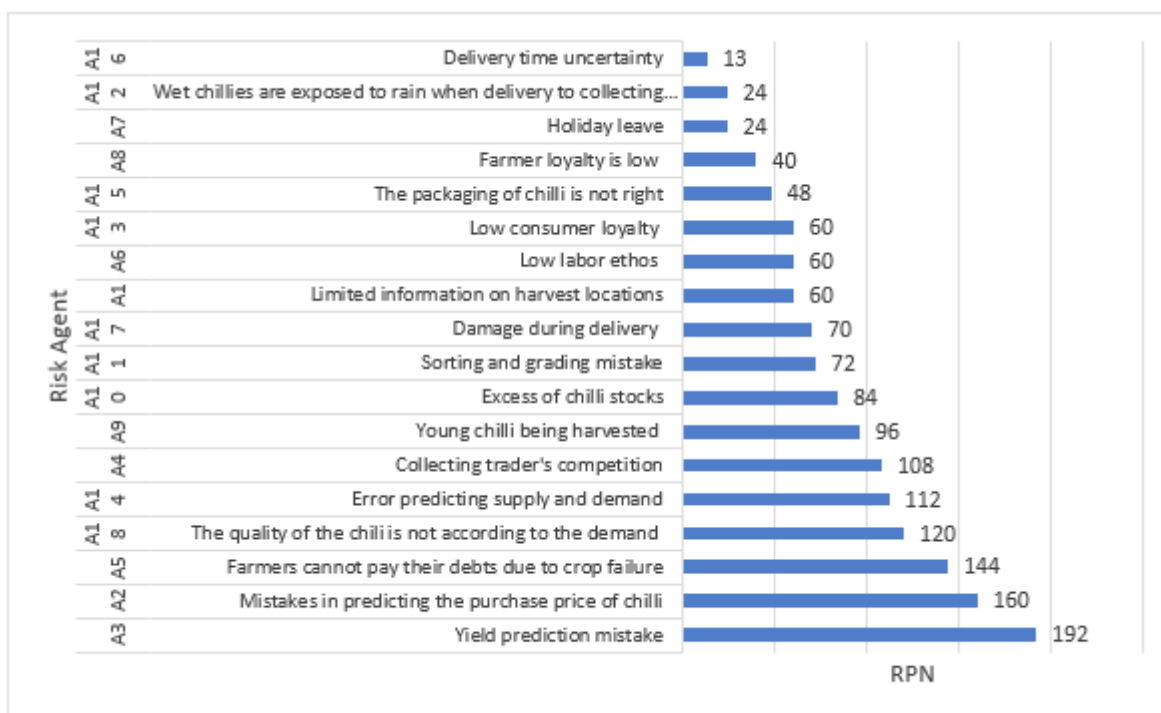
Figure 2a: Recapitulation of the accumulated RPN value of collecting traders.