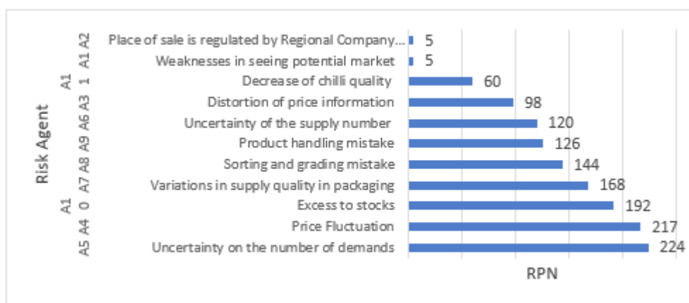
Figure 4a: Recapitulation of accumulated RPN value of retailers (Source: result of primary data processed, 2021).