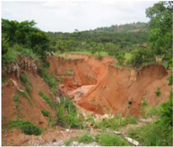
Figure 6: Gully Site at Nach-Agbalaenyi, Enugu State.