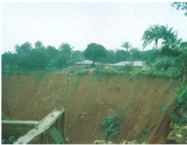
Figure 7: A Gully Site in Umuchu, Anambra State.