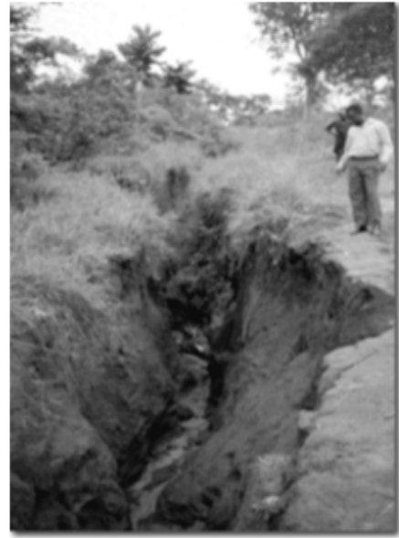
Figure 3: Gully erosion site in Amaokwe.