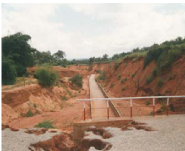
Figure 5: A Gully site in Umuchiana, Aguata, Anambra State, Abia State.