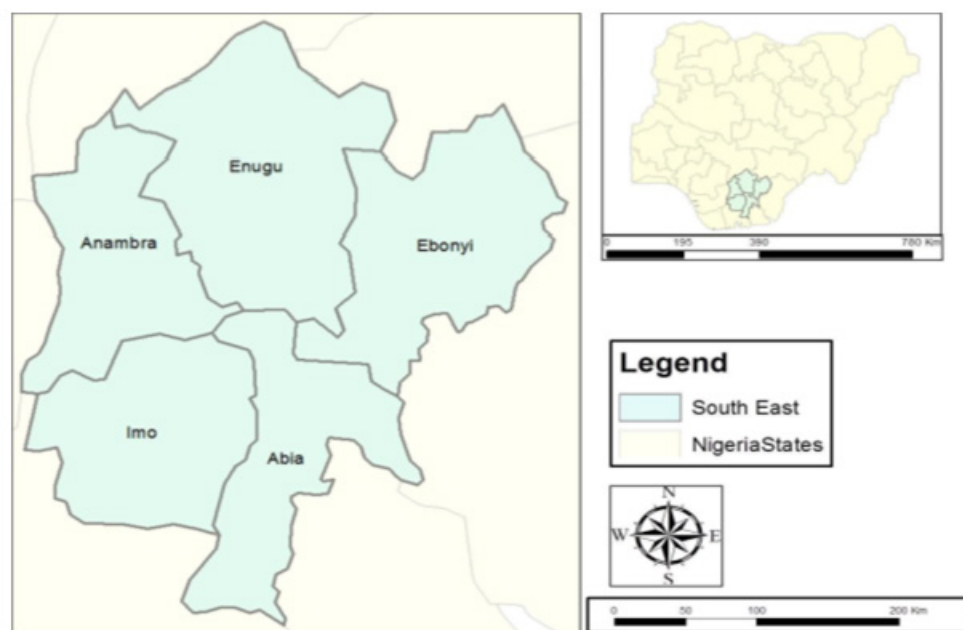
Figure 1: Map of the south east region of Nigeria showing the five component states. Map of Nigeria is inset [36].