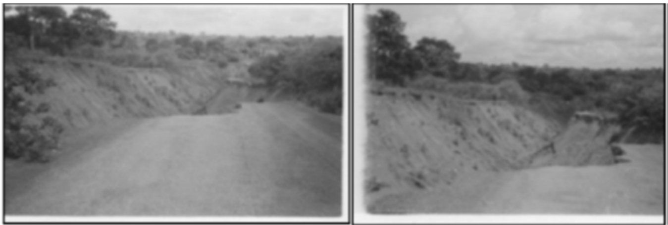
Figure 4: Eroded sites in Amaokwe Community, Abia State.