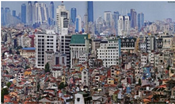
Figure 2: The place where the road goes [3].

in the old settlements. One of the biggest problems is the areas to be set off when the need for a possible urban transformation occurs in the regions formed mostly in the amorphous streets and in the buildings that have completed their life cycle (Figure 2). Because, at present, people do not renounce the dimensions of the buildings they are accommodating in and demand more. This issue is one of the main problems especially among the executives and residents during the transformation process [2].