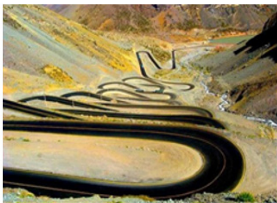
Figure 1: The path of the road [2].

The road is expressed as the distance traveled on land, in the air, in the water to go from place to place [1]. It can be said that it is an image of civilization. The place where the road was taken and the area where it is exceeded can be a measure of height, communication, culture, economy and well-being (Figure 1). It is the main parameter of the so-called urban. Roads to the focal point of the places that humanity has established since the existence of humanity. In this context, a civilization cannot be depicted without a path (Figure 1). The road points to a city. The city also ruled that there are people living there. In this context, when you build a city, you need to specify the routes that will be built in itself. It is no longer difficult to put the road space needed in the new settlements in line with the planning criteria. Because the new settlements are witnessing the moment in which the time is experienced, it can give the exact amount of land required. The main problem is generally