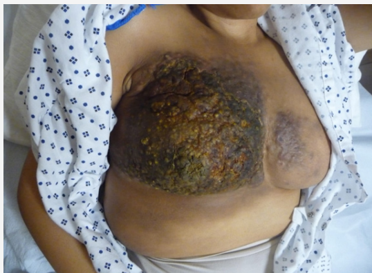
Figure 2: Breast tumour has spread to the skin.

These photos are from Latin America (Figure 2):