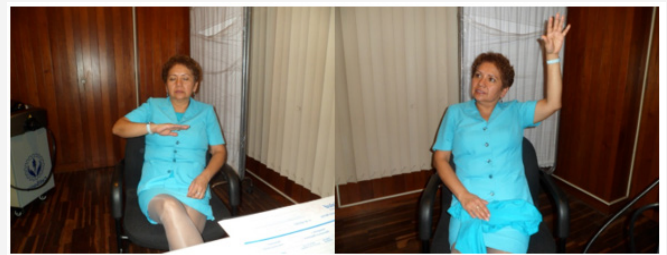
Figure 3: The lady could not lift her arm. Fifteen minutes after a five-minute treatment with CellSonic she could.

In 80% of cases, tennis elbow is cured with one CellSonic treatment of five minutes duration (Figure 3).