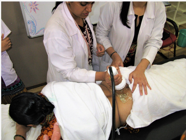
Figure 5: Lower back pain could be the predominant pain worldwide. Usually one CellSonic treatment is sufficient for permanent relief.