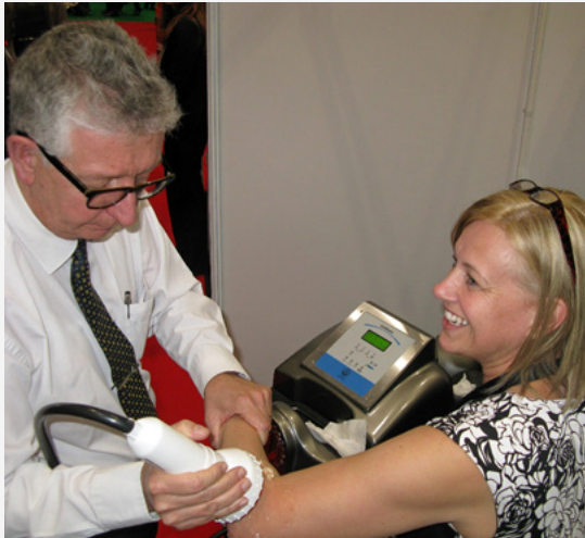
Figure 4: In 80% of cases, tennis elbow is cured with one CellSonic treatment of five minutes duration.

and two cases from Dr Mahajan in Mumbai whom I know well and have watched him treating patients.