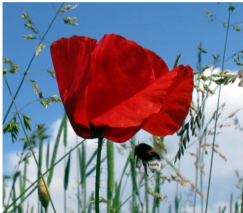
Figure 1: Photo of poppy and bee.

CellSonic has the only known cure for cancer. I made the discovery almost three years ago. The technology uses a non-surgical, irreversible electroporation whilst simultaneously applying a short duration, high pressure pulse to the tumour. The explanations, protocols and procedures are already published [10] (Figure 1). When I received the report from the doctor with this photo, I was shocked. We seldom see cancer. It is usually inside. Here a breast tumour has spread to the skin. This is stage 4 cancer, the stage at which most oncologists have ceased trying to stop the cancer.