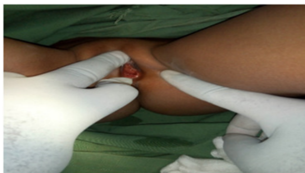
Figure 4: Post-operative picture of the vulva showing normal urethra and vagina.