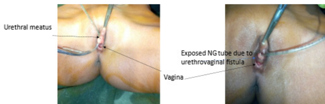
Figure 2: EUA picture showing the urethrovaginal fistula with an indwelling stent passing through the vagina(a) and proximal urethra(b).