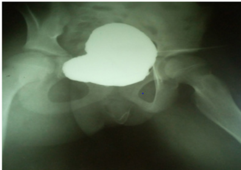
Figure 1: Micturating cystourethrogram showing huge urinary bladder with outpouching of the fundus and closed bladder neck.

This is a 12-year old girl who presented with 24 hours history of urethral bleeding, inability to pass urine and suprapubic pain following incision in the external genitalia by a local barber. No previous history of lower urinary tract symptoms or trauma. She had no comorbidity. She was in painful distress, afebrile, not pale, anicteric acyanosed. The vital signs were normal. The urinary bladder was palpable and tender. There was blood at the introitus and longitudinal incision involving urethra, clitoris and labia minora. Diagnosis of acute urinary retention secondary to female genital mutilation was made. Attempt at urethral catheterization with size 8 and 10 Foley's catheter failed for which she had suprapubic cystostomy. Trial of voiding per urethra at 11 weeks post injury was done and the patient was unable to pass urine. Micturating cystourethrogram revealed huge urinary bladder with outpouching of the fundus and closed bladder neck (Figure 1).