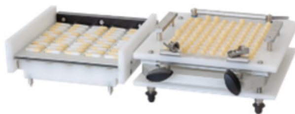
Figure 1: Manual Encapsulator.