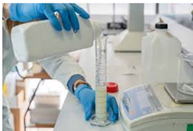
Figure 2: Galenic Laboratory.