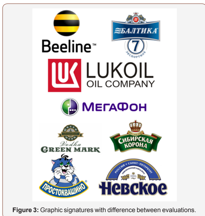
Figure 3: Graphic signatures with difference between evaluations.

For the other graphic signatures of the brands 01- MTS, 06- Sberbank, 07- Pyaterochka, 08- TNK, 09- Rosneft, 10- Domik V Derevne, 31- Kamaz, 33- Chudo, 37- Agucha, 38- Rosbank, 39- J7 and 40- Beluga, the difference between the two evaluations does not allow us to reject the Null Hypothesis, which does not allow us to state that there is a difference between the number of responses “Like” in the evaluations made in Time 01 and Time 02. We only compare in this test the difference between the “Like” response because the “Dislike” responses varied in the same intensity, only in the opposite direction. While the number of one has increased, the number of one has decreased. The illustrations of the graphical signatures that did not have a significant difference between the two evaluations are shown in Figure 04.