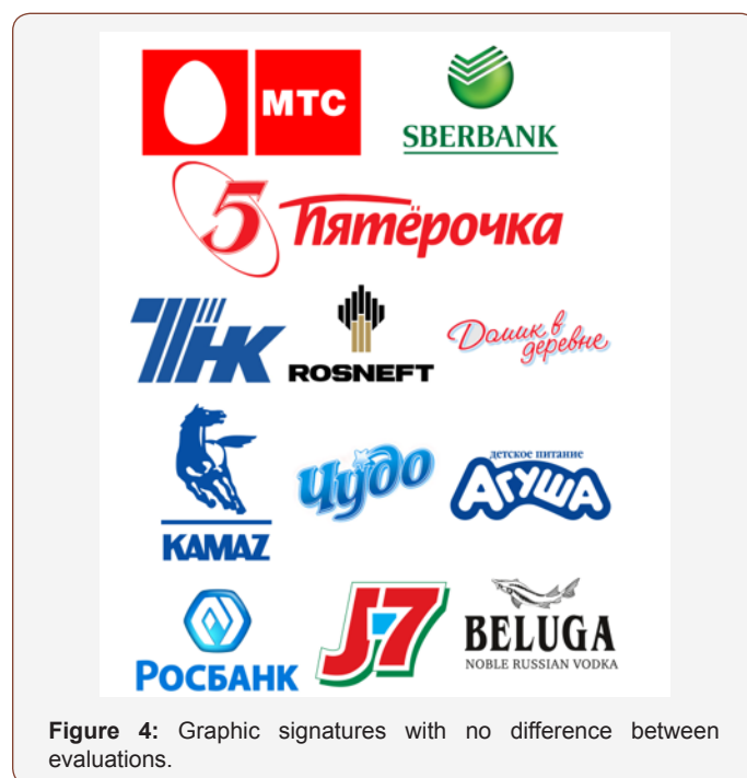
Figure 4: Graphic signatures with no difference between evaluations.

From the data presented in Table 02, it can be seen that the graphic signatures of the brands 02- Beeline, 03- Baltika, 04- Lukoil, 05- Megafon, 32- Green Mark, 34- Sibirskaya Corona, 35- Prostokvashino and 36- Nevskoe, presented significant difference between the evaluations made in Time 01 and Time 02, totaling eight graphical signatures with difference between the two evaluations generated by the reactive and analytical responses of the participants. Among them, six had a positive variation between the evaluations made, increasing the number of responses “Like” in