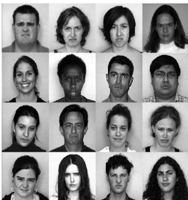
Figure 1: Matrix presented to participants in the experimental condition in which they received attentional training (find-the-smile) Dandeneau & Baldwin [19].

A computer was used to display either an ATT task or control task. The ATT task consisted of 16 faces, only 1 smiling (Figure 1).