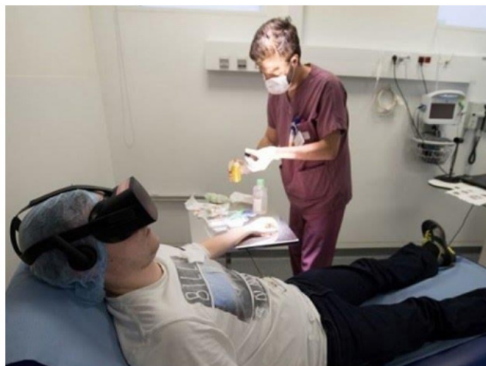
Figure 2: virtual reality for pain relief in hospitals Huffpost canada 2021.

including opioids, which can give inconsistent and suboptimal results. Therapeutic virtual reality (VR) has become an effective and non-pharmacological treatment modality for pain [4,5]. VR users wear a head-mounted display with a proximity screen that creates a feeling of being transported to realistic three-dimensional worlds (Figures 1-2).