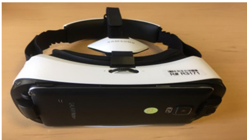
Figure 1: VR virtual reality headset.

Virtual reality has found its place with patients as a therapeutic aid. For a large number of pathologies, such as cancer, it is used because it is a revolutionary technology but above all gentle and without side effects. VR refers to the interactions between an individual and a computer-generated environment stimulating multiple sensory modalities, including visual, or auditory experiences, The user's perception of reality is facilitated by the use of headsets (HMD, in glasses or helmets), (Figure 1).