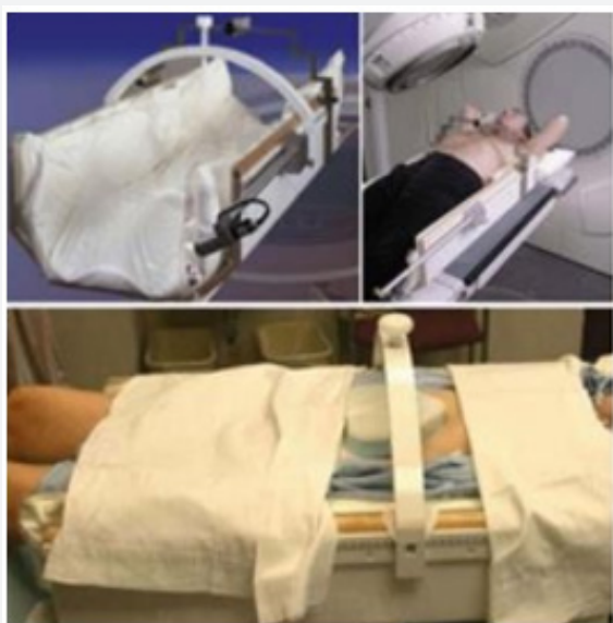
Figure 1: (Method 1) Motion Damping.