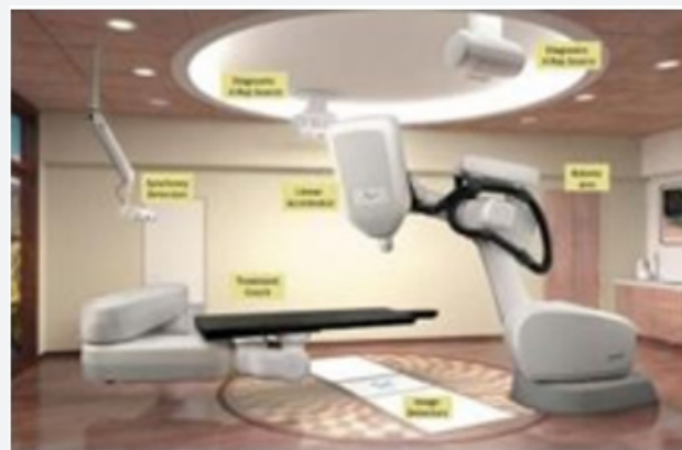
Figure 2: (Method 2) Motion Blockage, And Movement Tracking.